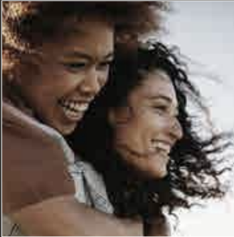
A Community of Belonging