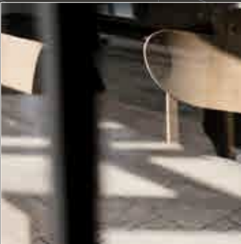
Serenity in Every Detail