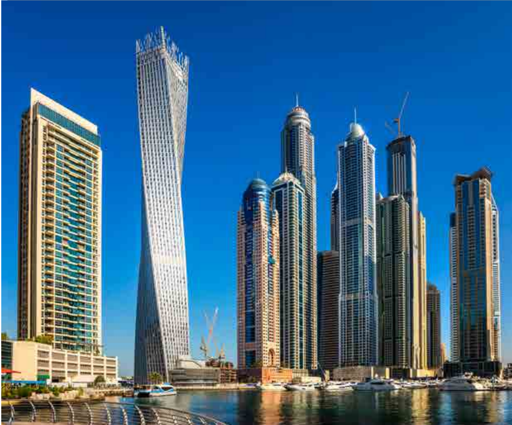
Infinity Cayan Tower