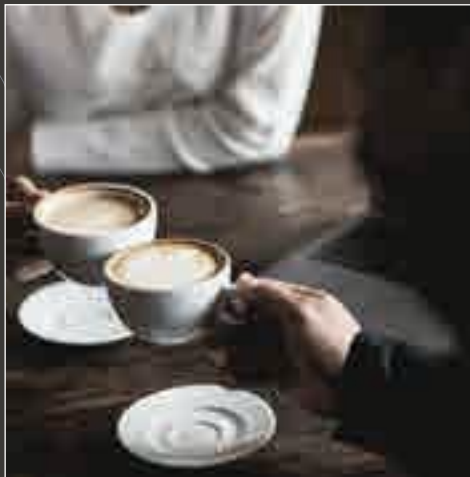
The Heart of Inspired Living