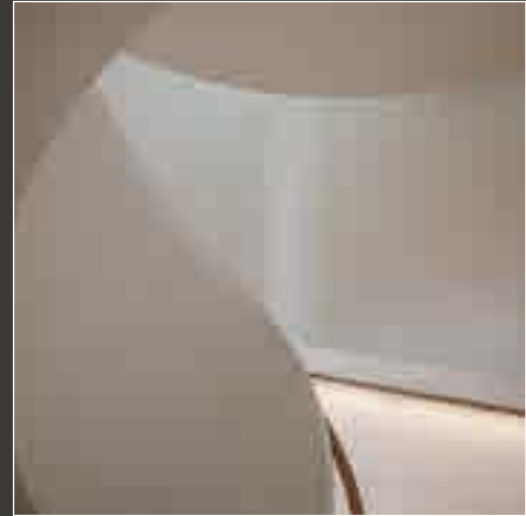
A Symphony of Timeless Elegance