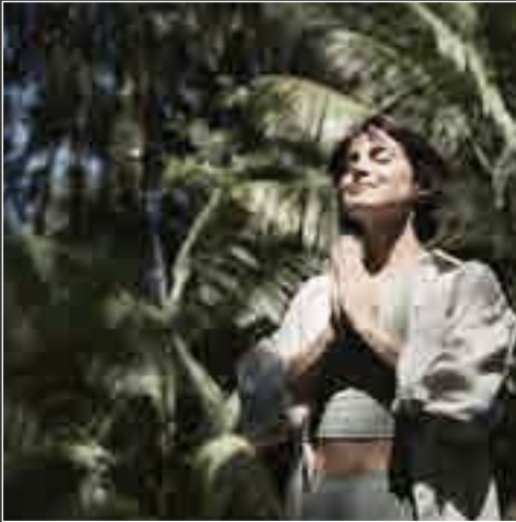
A Haven of Tranquility