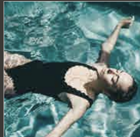
A Resort Lifestyle